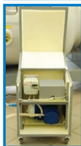
The pumping unit (when using the hypobaric mode) has the dimensions 0.48x0.49x0.57 m