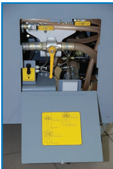
There are three ball valves located in the lower part of the hyperbaric unit for switching modes (hyperbaric/hypobaric)